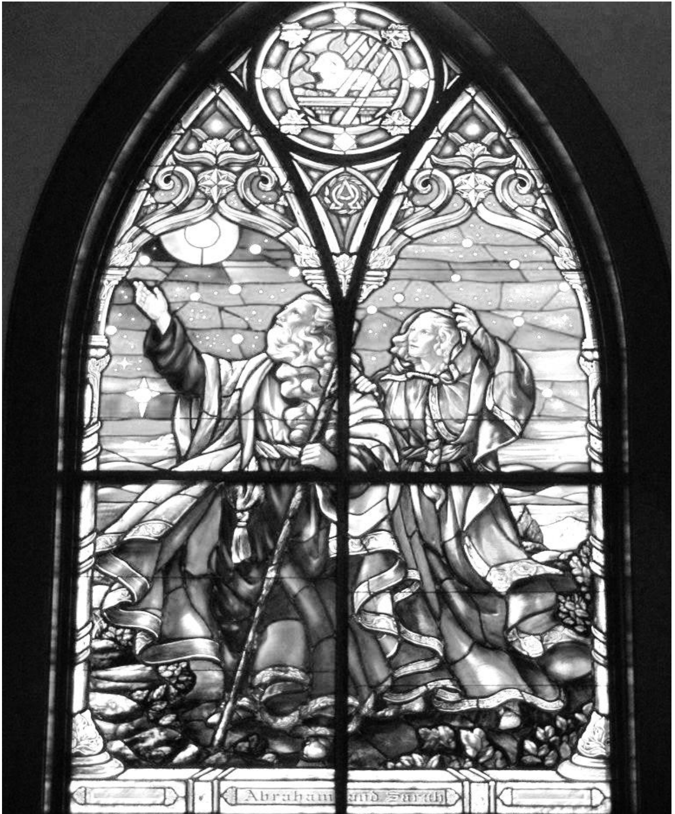
St. Hilary's Church, Wallasey